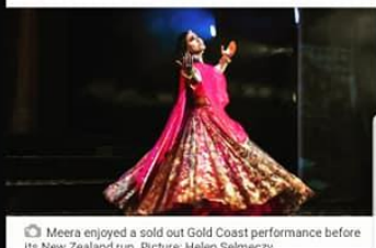
Meera enjoyed a sold out Gold Coast performance before its New Zealand run.